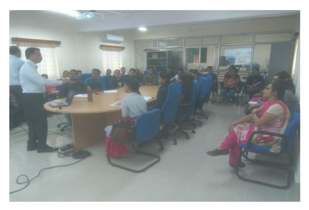
Environmental survey laboratory, TAPS, Boisar